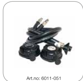
OR MANUAL INJECTION PACK BMCL